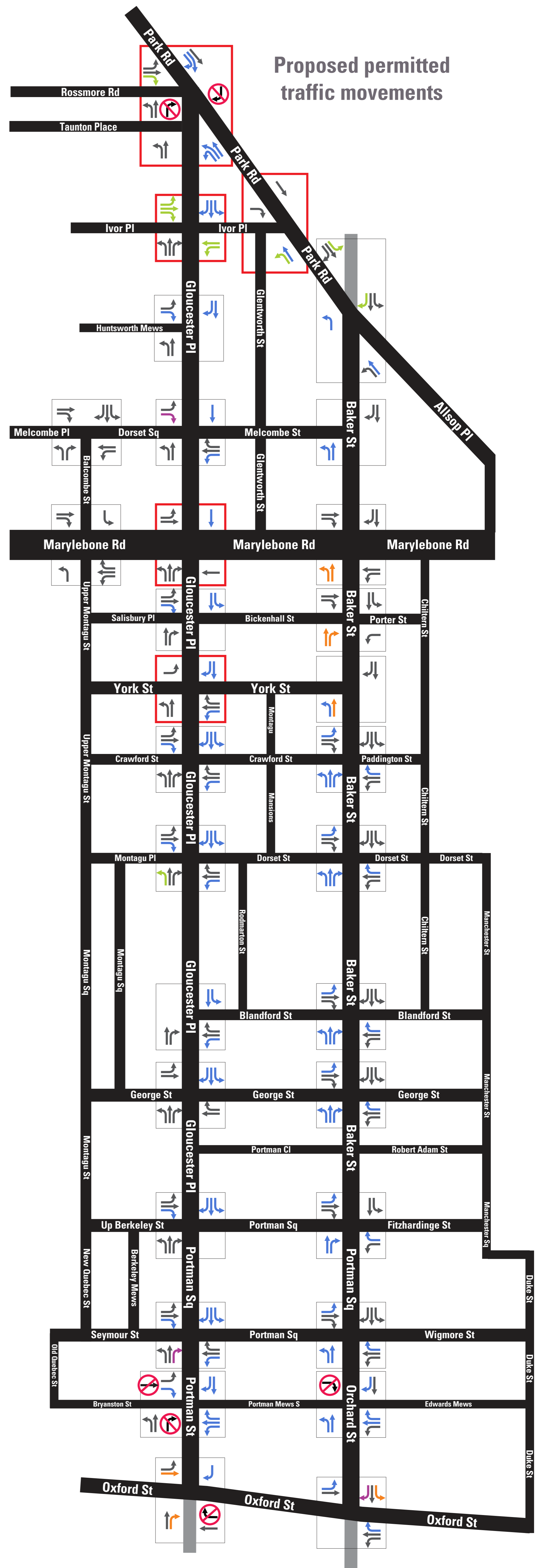
Proposed permitted traffic movements